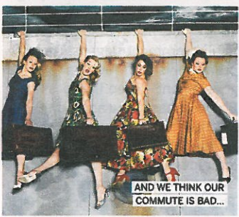
AND WE THINK OUR COMMUTE IS BAD...