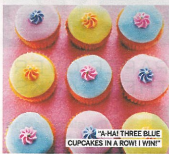
"A-HA! THREE BLUE CUPCAKES IN A ROW! I WIN!"

BIRMINGHAM The Voyage; 21-24 June; outside Birmingham Town Hall, Victoria Square, B3; free; thevoyage.org.uk Retro hair rolls, A-line skirts and bowler hats return for this impressive dance and acrobatic production with 170 performers set on a giant ship-like stage. The story maps out how sea travel, mass trade and global migration shaped the history of Birmingham and the Britain we live in today.