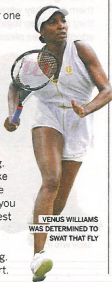
VENUS WILLIAMS WAS DETERMINED TO SWAT THAT FLY

NATIONWIDE Women Try Sport Day; 21 June; wsnet.co.uk ; facebook.com/women.try.sport.day When Stylist launched our Fair Game For Women In Sport campaign, we discovered only one in eight women regularly play sport, which is why the launch of Try Days – designed to encourage women to try new sports – is so groundbreaking. Try Days will take place across the country, giving you the chance to test out a range of sports, from tennis to fencing. See you on court.